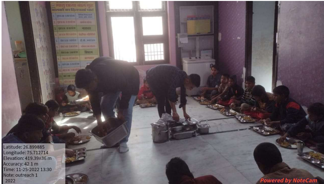
Students of SHTM and Epicurean Club are serving food prepared by them to the children’s of Matra Chaya Bal Grah .