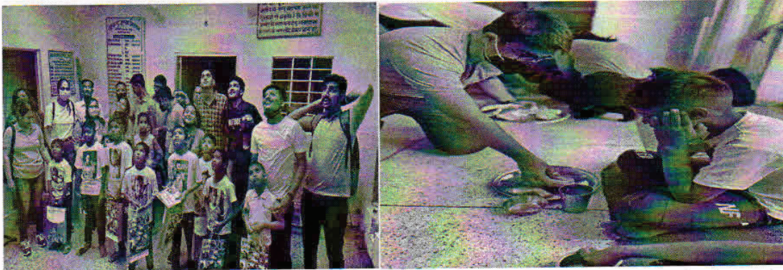
MUJ students along with the orphans at Shree Hindu Anath Ashram.