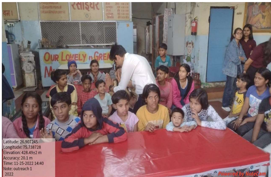
Image Students of SHTM playing and enjoying with children's of Surman Sansthan.