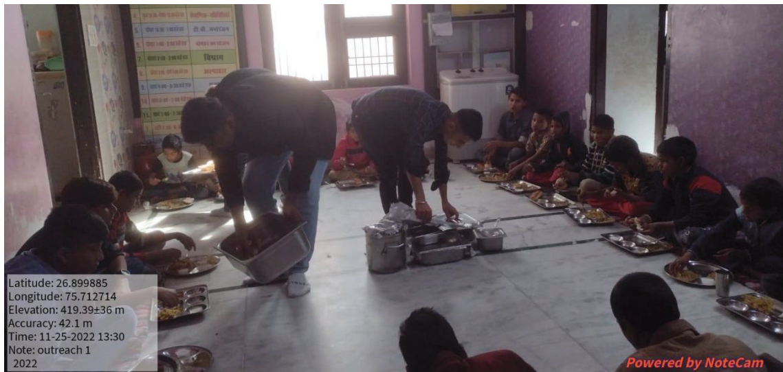
Students of SHTM and Epicurean Club are serving food prepared by them to the children's of Matra Chaya Bal Grah.