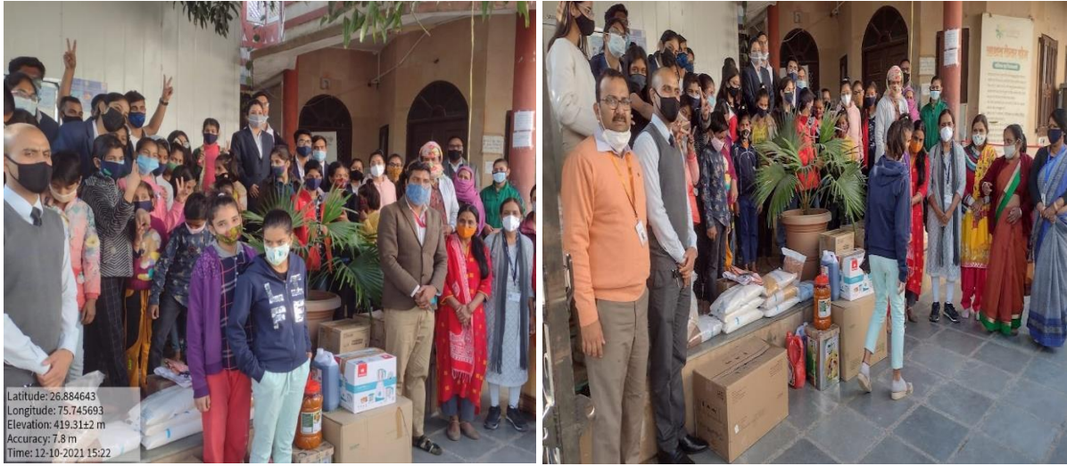
1 Faculty and MUJ students at Ashray Care, Jaipur