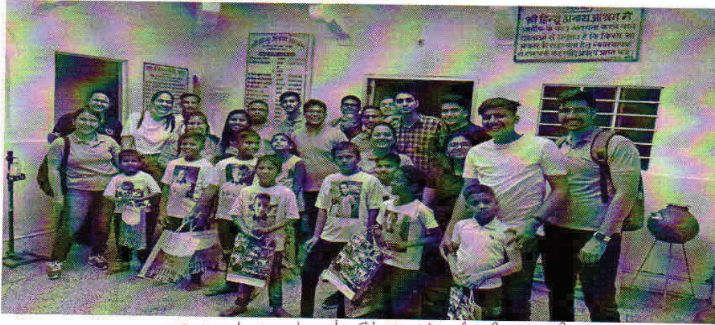
Outreach event at Shree Hindu Anek Ashram.

Overall it was a memorable effort which the students of MUJ had shared during this outreach event. All the covid related protocol was followed during the event.